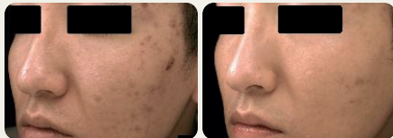
Results after 16 weeks once daily

Correct pigmentation with CYSTEAMINE | Modulate InflammAging with ISOBIONIC-AMIDE.